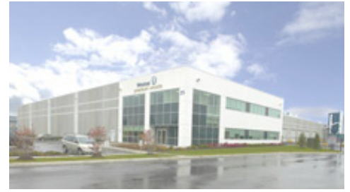
Weston Premium Woods’ 105,000-square-foot head office is located on eight acres just 25 minutes from downtown Toronto and minutes from all major roadways.

“Another part of providing quality products is that all of our lumber and sheet goods are loaded and unloaded indoors in our warehouse facility here,” said Poulos. “So, whether it’s at a loading dock or at ground level, the product that we are selling is never exposed to the elements. Everything is