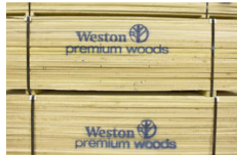
Kiln-dried FAS1Face #1 White Hard Maple ready to be loaded into a container for shipment.